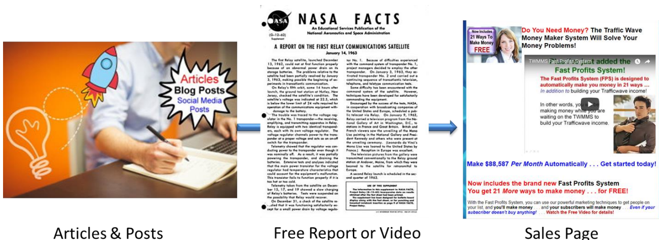
Figure 2: Offer a free gift containing links to your sales page

And since you gave him the valuable gift for free, he feels a latent desire to return the favor and buy your offer. This is what the Law of Reciprocity is all about. This alternate model looks like this: